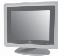
▲ Desktop stand