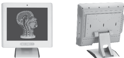
▲ Stand kit