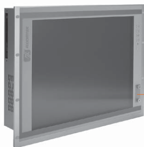
Front USB ports