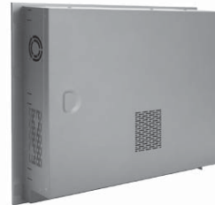
▲ Less screw design