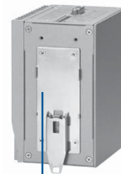
Din-rail kit ▲ Rear view