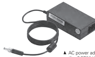
▲ AC power adapter (for GOT5840T-834-J)